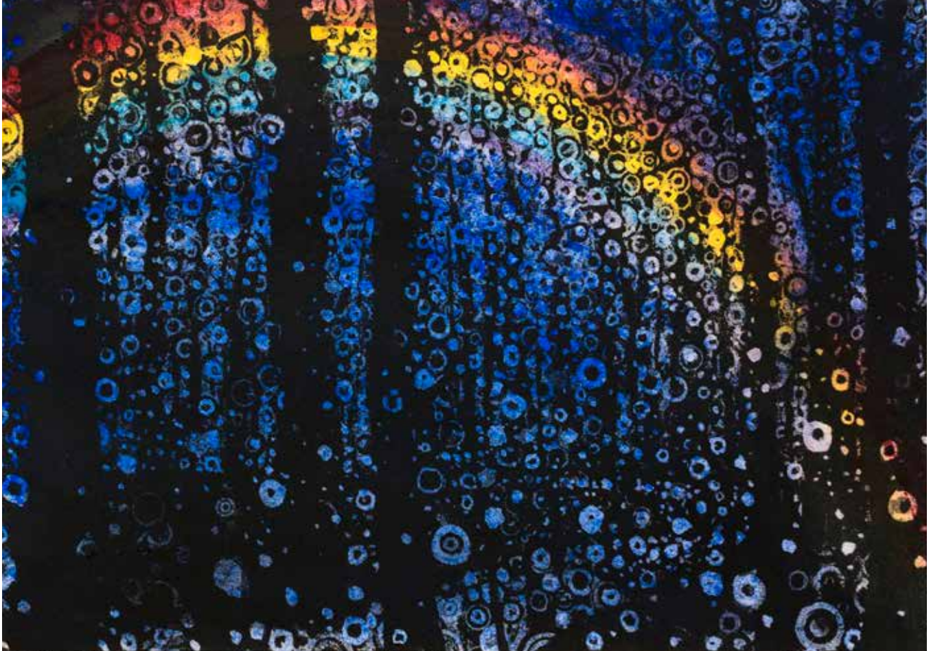
"Lost" by Randall Stoltzfus was one of the art pieces displayed at the PJSN art auction in Kansas City.