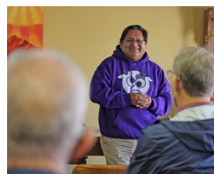
Solidarity With Indigenous Peoples Pilgrimage