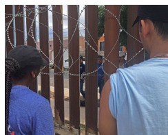
Christ at the Borders Pilgrimage